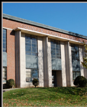
Grainger County Courthouse