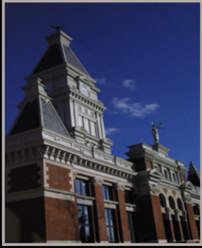
Montgomery County Courthouse