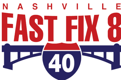
Logo, press release and detour map provided courtesy of TDOT.

Note: Please also periodically update your Directory bookmarks. The Directory uses Java to display information. Go to http://www.java.com to make sure you have the latest version (if your IT department allows the use of Java).